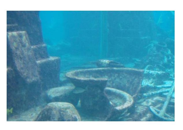
Figure 2: Underwater archeological project

The ACUA is an international advisory group for underwater archaeology, conservation, and management of submerged cultural heritage. Its goal is to raise awareness of underwater archaeology and the protection of undersea resources among academics, governments, sport divers, and the general public. Underwater archaeological projects range from exploration of World War II tanks in the Pacific to 19th-century shipwrecks sunk below the ice of Canada's Arctic Sea, and from surveys of artificial islands in Polynesian Ponape to inundated springs and caves in Florida and Mexico containing the